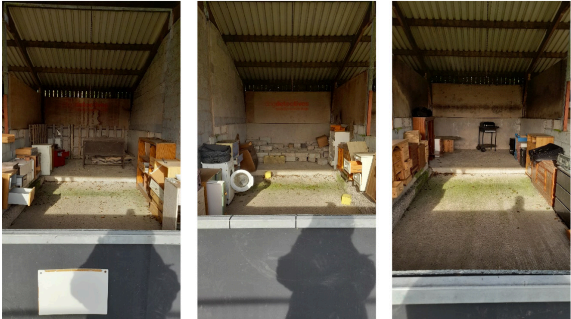
Figure 1. Three bays used to hide the explosive materials: trinitrotoluene (TNT; left), composition 4 (C4; middle) and ammonium nitrate (AN; right). Each bay was 5 m wide and 10 m long — photos taken by EJ.